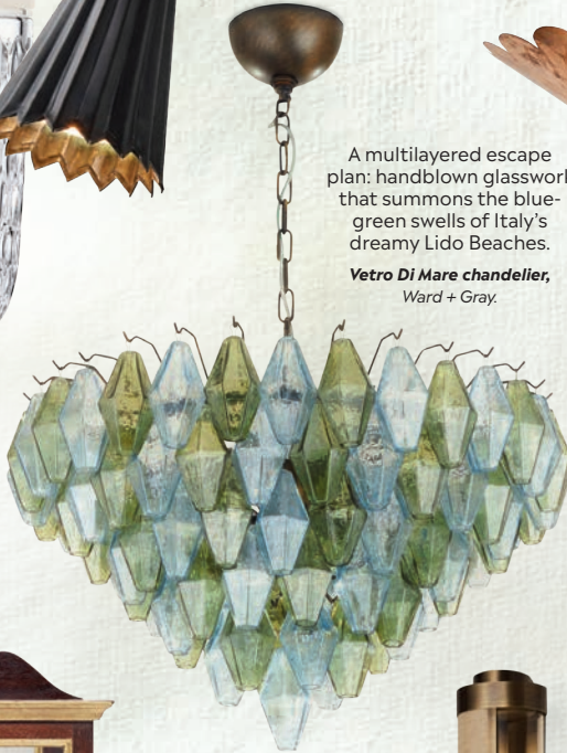
Vetro Di Mare chandelier, Ward + Gray.

Stacked glass bubbles recall watery journeys down Venice's canals, while an interior brass spiral mimics rippling water.