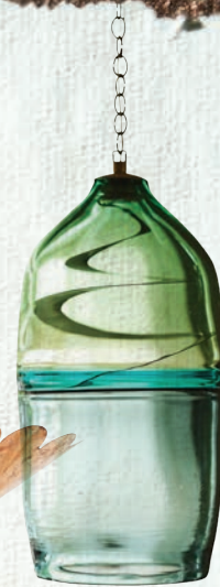
Rachel Shillander Scalloped torchiere, The Future Perfect.

Architect Rachel Shillander brings playful scalloped edges to a metal torchiere crafted of raw copper.