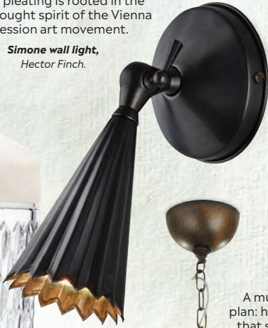
Simone wall light, Hector Finch.