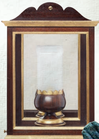
Scallop wall light, Porta Romana.

Alight with fine gilt trim, this polished mahogany wall lantern tips its cap—and a classical crest—to its stately Georgian predecessors.