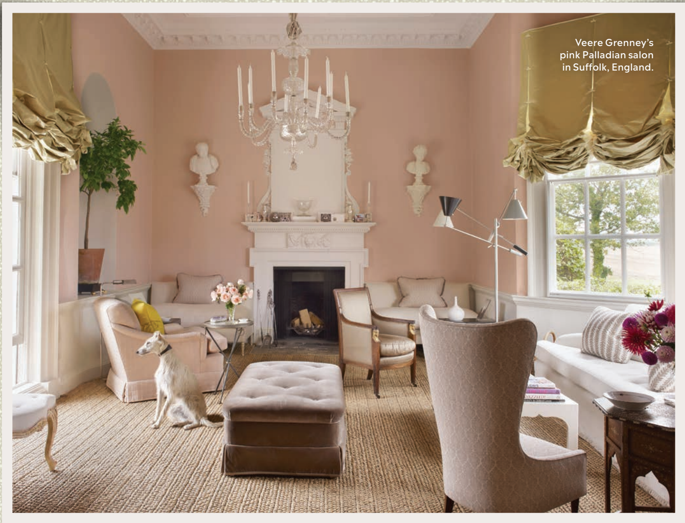
Veere Grenney's pink Palladian salon in Suffolk, England.