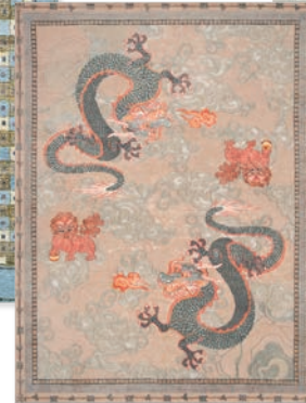
↓ Cadmus rug, New Moon Rugs.