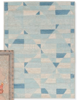
↑ Scandinavian High rug, Rug & Kilim.