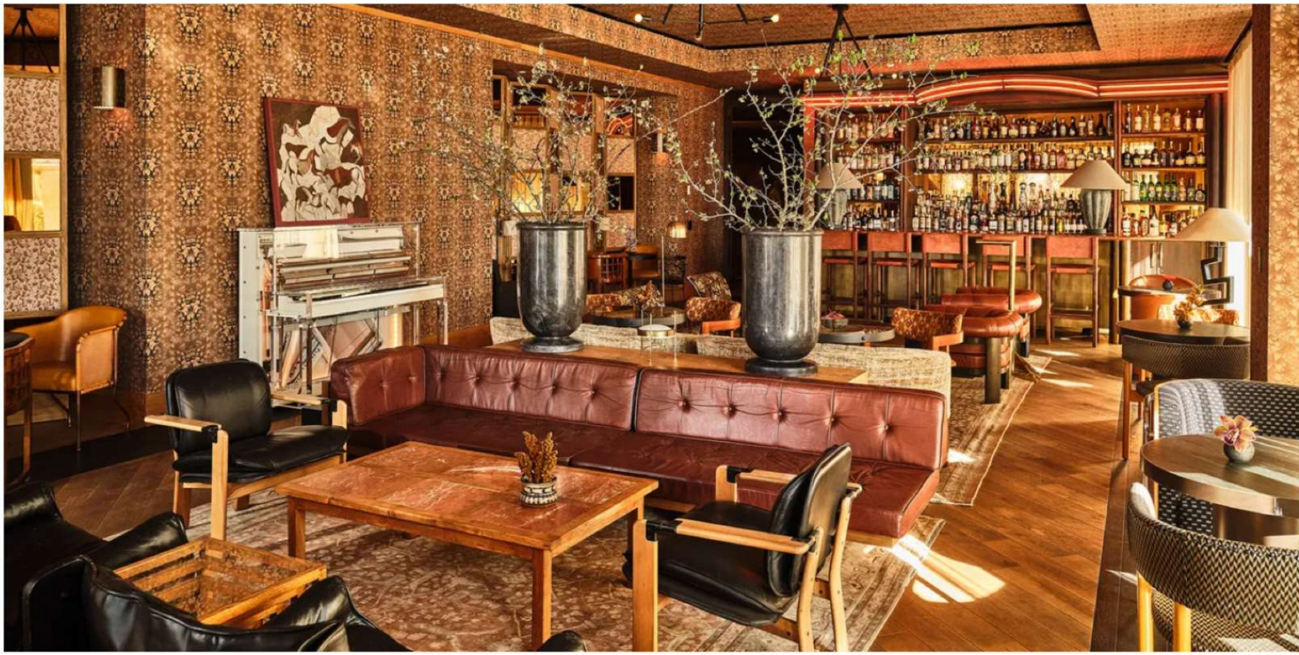
At the Quill Room, Kelly Wearstler melded retro Parisian vibes with punches of Texan audacity.